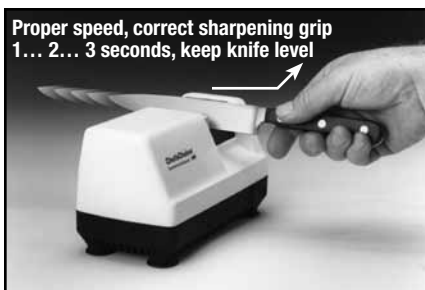
Figure 4. You will find it easier to use a loose grip.