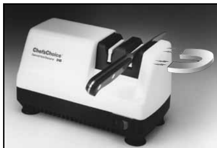
Figure 3. Magnets control the blade angle.