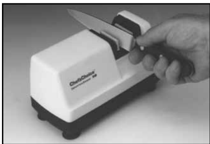
Stage 1. “Breaking-in” knife in Stage 1 will take 15 to 20 passes through each slot, alternating left and right slots. Subsequent resharpenings require fewer passes in Stage 1. Apply light to moderate downward pressure.